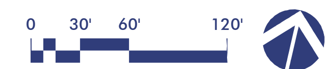
Concept Master Plan